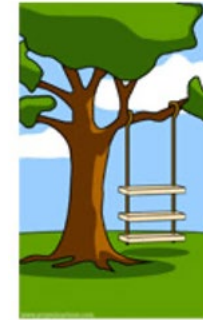
How the customer explained it.

Do users know what they want? Do users know what we don't know? Do we know who are users even are?