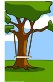
How the project leader understood it.